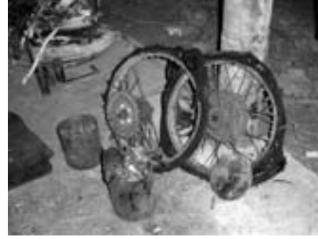
Approximately 6 months ago we decided to Re Restore the bike. Neil & I went to Christchurch to an old guy's

place that restored old Matchless & AJS bikes. He had two hubs and 1 rim. The wheels were restored again & new spokes bought in along with other parts from the UK. We set up the frame with the crankcases & wheels to check the alignment of the frame etc in Neils new workshop at Washdyke. All seemed in order so I carried on building the bike up. We spent lots of money & many hours, Neil made lots of special bolts & spacers etc & painted all the frame & tinware. While Neil was doing this I restored the motor & gearbox etc.