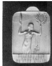
In recognition of outstanding academic achievement, good character, and superior intellectual promise in the field of science.