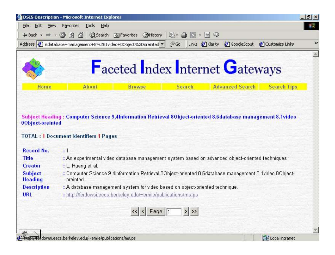
Figure - 12: Retrieved Record Display

It is possible to change the display to produce an organized index of different levels to make browsing easy. By bringing the required category (along with its sub-divisions) to the beginning of the subject chain, the organizing effect can be changed. The sequence can be varied according to the user. It can be presented as discipline-based if the user of the system is an academic. It can be changed to entity (object) based or action (process) based. When resources are collected for indexing and to build search files, it may be possible to exercise control over synonyms and standardize the terms used. It may also be possible to have a switching from non-standard terms used by the searcher to the standard ones. When any term used by the searcher is poly-hierarchic, then the subject chains in which the term occurs (only the super-ordinates in the category to which the term belongs) can be displayed, perhaps along with the term denoting the discipline or base in reverse order and the user can be asked to select the appropriate chain representing his/her query. It is possible to incorporate synonyms due to semantic factoring so that the system searches for the combination of factored terms to be present in faceted subject headings. It is possible to sort the headings and present higher level indexes for easy browsing. It is also possible to resolve the meaning of homonyms by displaying the full faceted