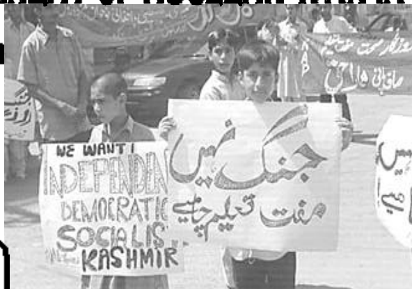
Young socialists in Kashmir