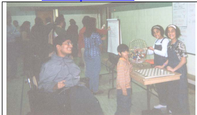
At the Bingo!