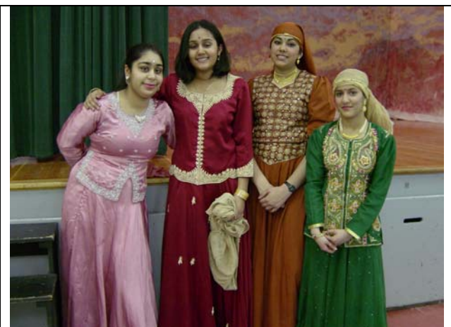
Posing at Buena Vista School