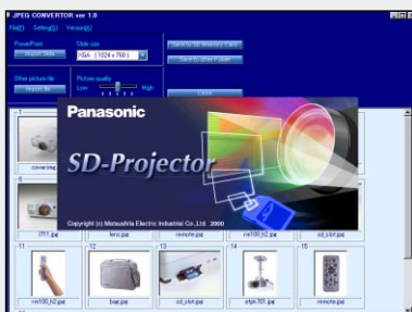
The PT-L702SDE comes supplied with file conversion software.

The PT-L702SDE also comes complete with a 16MB SD Memory Card and a PC card adapter for it.