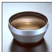
Wide Conversion Lens ET-LEC701

Photo shows the PT-L712E with the ET-LEC701 wide conversion lens attached.