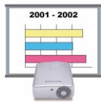
After auto setup