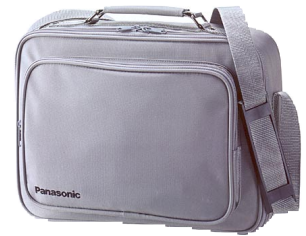
Each model comes supplied with a carrying bag.

The brightness of each model is measured in compliance with "Guidelines for LCD Projector Measuring Procedures and Measuring Conditions" by the Japan Business Machine Makers Association (JBMA). Fan noise is measured in compliance with the ISO7779 standard.