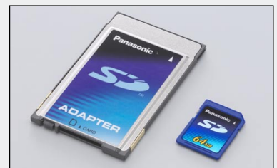
Supplied 16MB SD Memory Card (right) and PC card adapter (left)