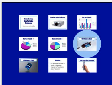
Thumbnail Display for easy editing on the spot.