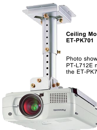
Ceiling Mount Bracket ET-PK701

Photo shows the PT-L712E mounted on the ET-PK701 bracket.