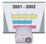
Before auto setup

One-Touch Auto Setup provides a wide range of automatic adjustments, from phasing to dot clocks, to vertical sizing and horizontal blocking. The list goes on to include keystone correction and RGB input signal selection. Panasonic's original built-in gravity sensor detects the projector angle relative to the floor (up to 30 degrees), then corrects for keystone distortion accordingly. A new IC also minimizes picture degradation. Simply press the Auto Setup button to automatically tune and adjust the image for optimal viewing.