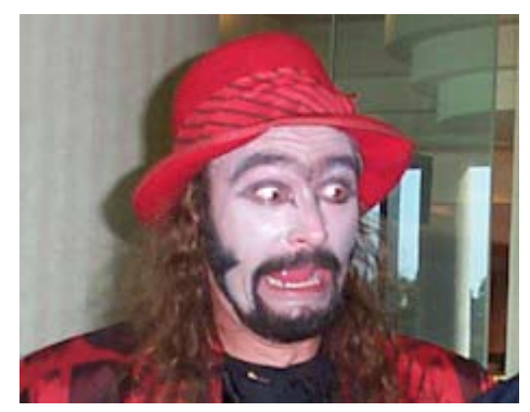
A. Ghastly Ghoul

I will give you the A-to-Z list of the current horror hosts who are on cable access and network TV. Who knows, I might introduce a few new faces to you.