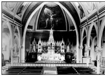
The Altar of the new Immaculate Conception Church in 1874.