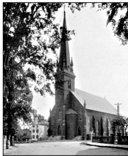
The Second Church of the Immaculate Conception in 1874.