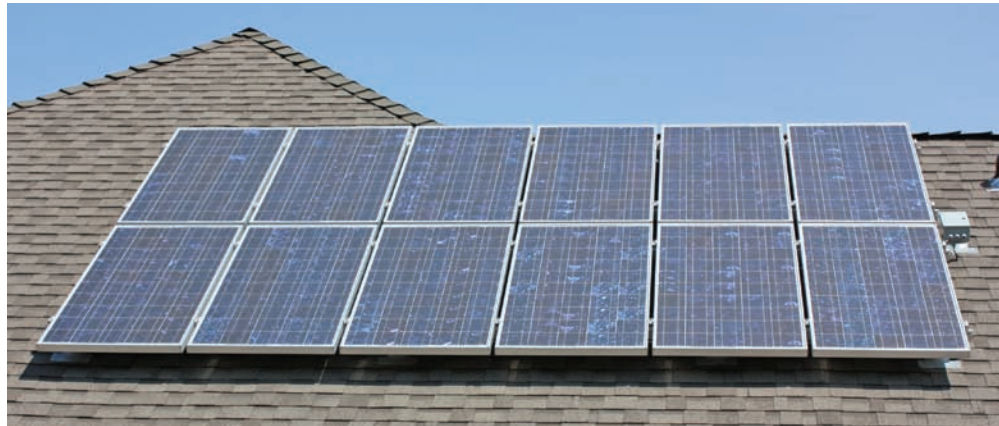
PV systems are great additions to any home with good solar access, but their efficiency is still well under 20%. Payback time on PV systems can be many years.

Now let's look at a simple PV payback scenario based on a 2 KW, batteryless grid-tied system. The estimated installed cost of this system is between $16,000 and $20,000 ($8 to $10 per watt). Calculating system KWH production is done slightly differently for PV systems than for SHW systems, but both methods arrive at the average expected KWH production. This example system is also located in Richmond, Virginia, again at 4.8 average peak sun-hours per day. Average peak sun-hour values account for cloudy days, so we can simply assume that 4.8 hours per day of full sun is received every day of the year. We also multiply by a 0.70 derating factor to account for inefficiencies due to temperature, inverting, module production tolerance, wiring losses, and module soiling. This system can produce an average of 6.72 KWH per day (2 KW x 4.8 sun-hours x 0.70 derating) and 2,453 KWH per year. Plugging this estimated output into different electricity costs gives us the info for the PV Payback table.