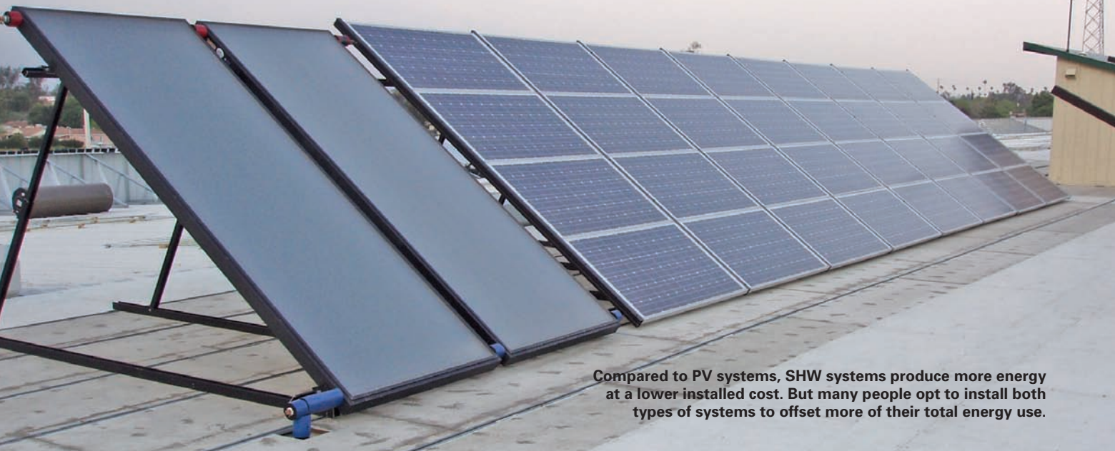
Compared to PV systems, SHW systems produce more energy at a lower installed cost. But many people opt to install both types of systems to offset more of their total energy use.