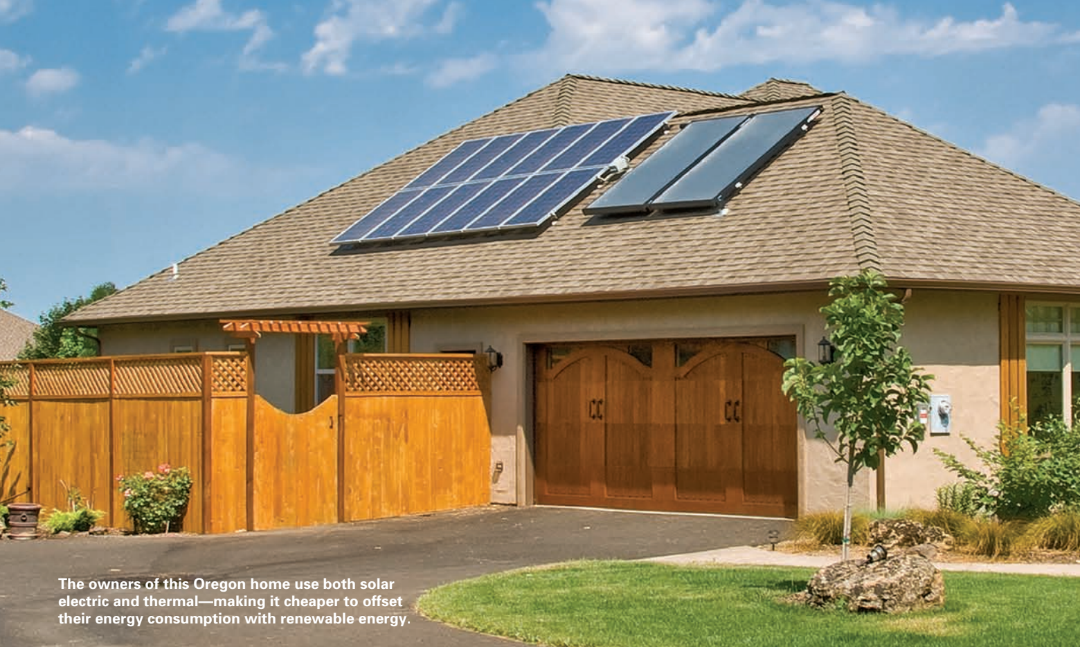
The owners of this Oregon home use both solar electric and thermal—making it cheaper to offset their energy consumption with renewable energy.