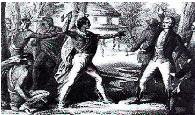
Tecumseh and William Henry Harrison

The thought that a few words written by man and interpreted as God' s instructions that the white man has title to