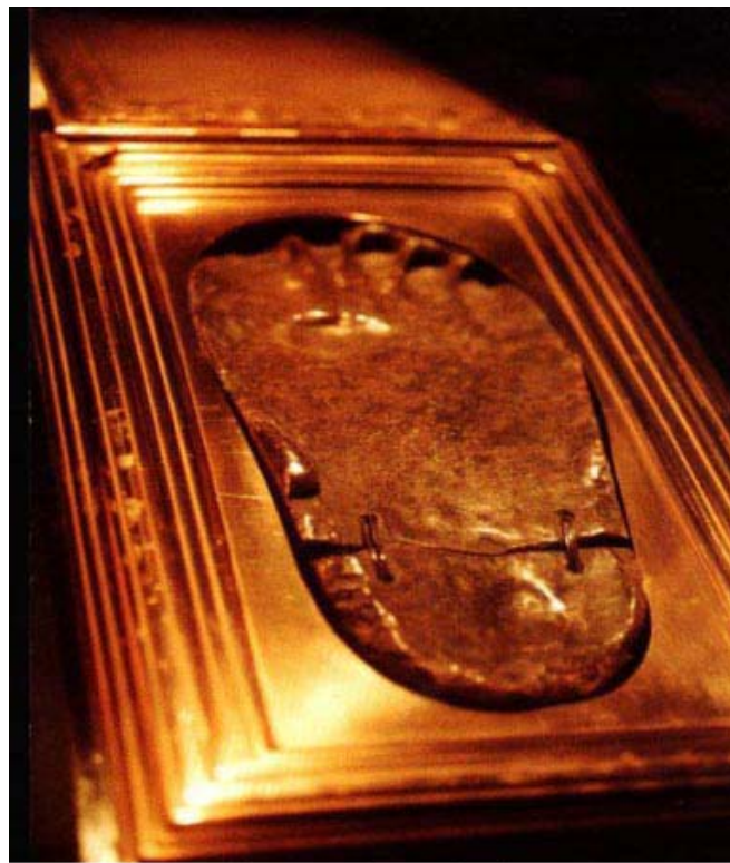
Prophet Muhammad's right foot print on a marble plaque Topkapi Museum, Istanbul Turkey