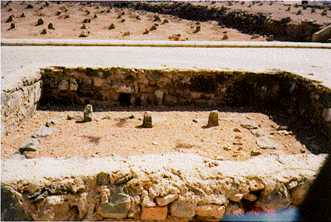
Graves of the Prophet's aunts Safiya & Aatika as well as the grave of Umm al-Banin, wife of Imam Ali [a] and mother of Abbas [a]