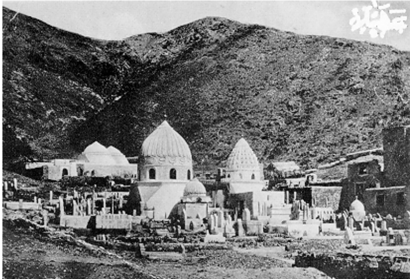
Cemetery of Jannat al-Mualla in Makkah before it was demolished by King al-Saud