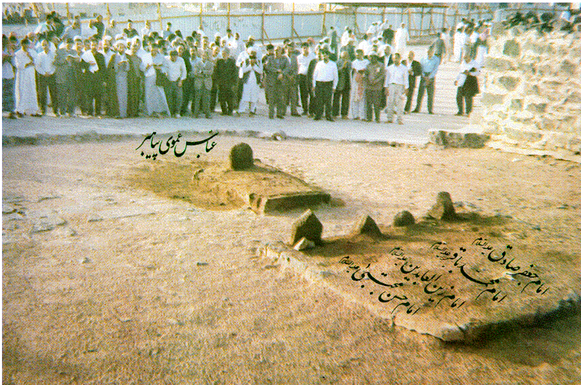
Graves of 2nd, 4th, 5th & 6th Imams with the grave of Abbas b. Abdul Muttalib (Prophet's uncle) at the front - Jannat al-Baqi, Madina