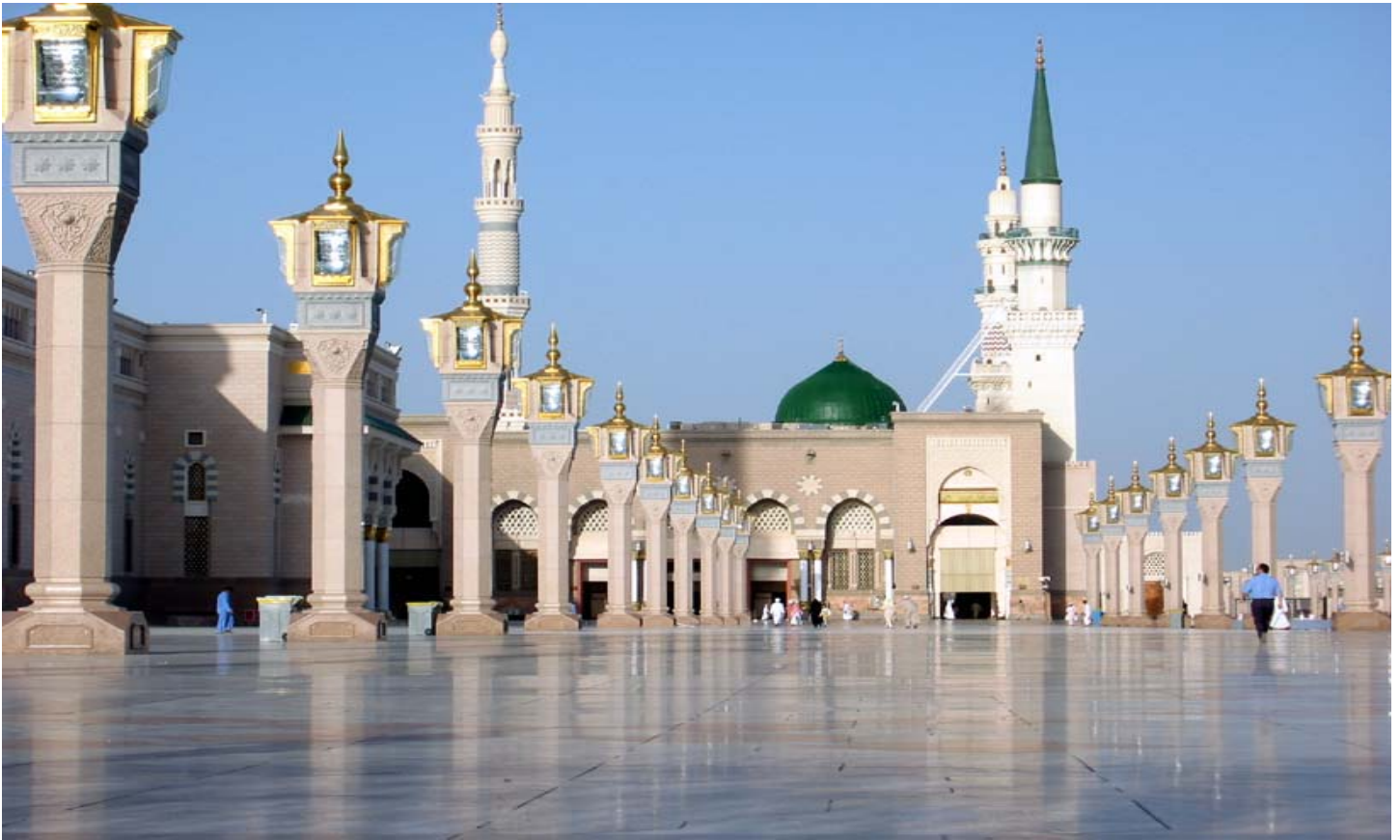
Masjid e nawabi