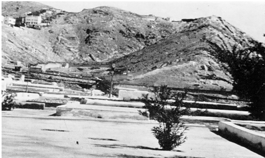
Jannat al-Mualla: after demolition. The Prophet's [s] ancestors, Sayyida Khadija, Abu Talib and many other pious personalities are buried here