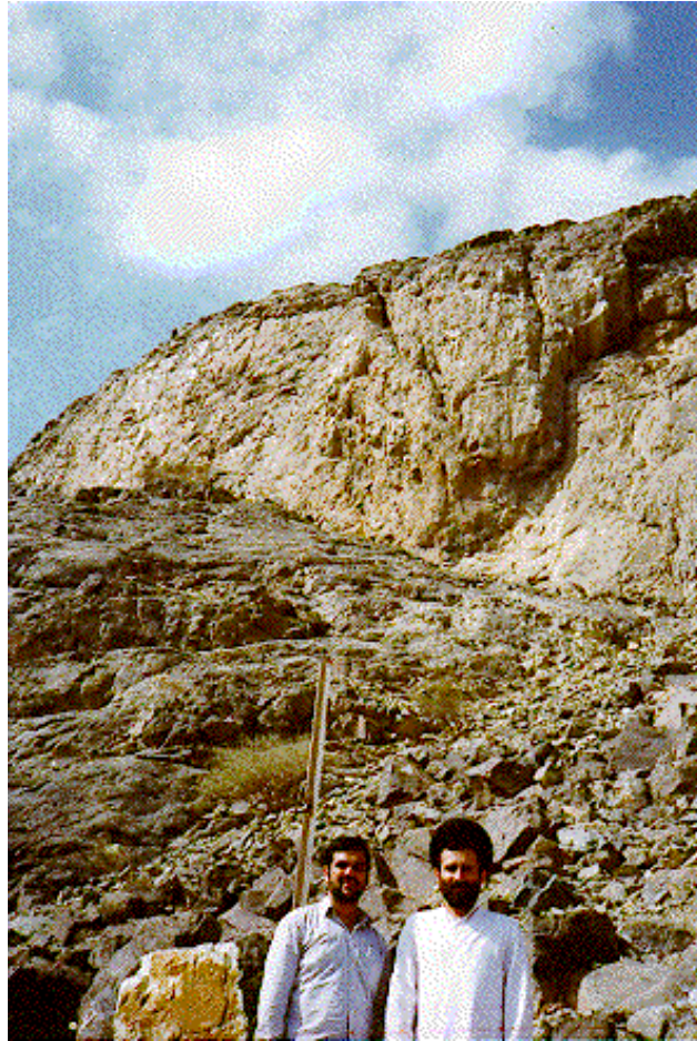
Close up of Jabal Nur. At the top is the Cave of Hira