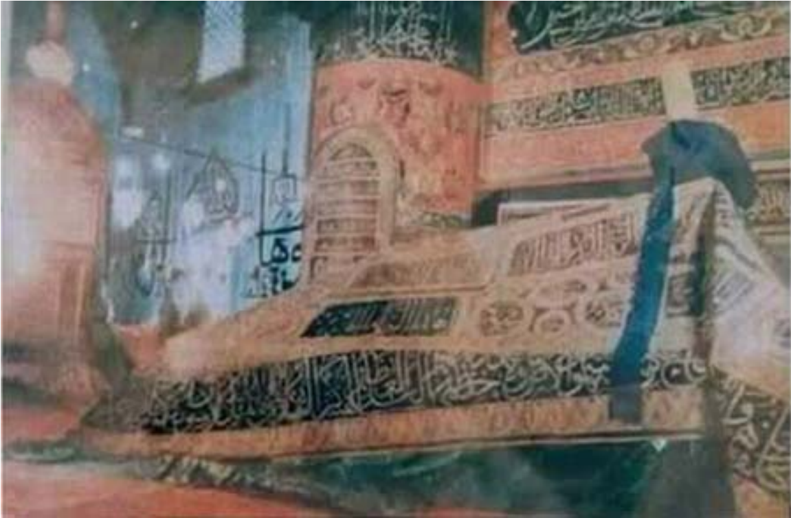
This is a view of rawza e rasool (PUB). Only 0.1% of visitors are fortunate enough to have this view.