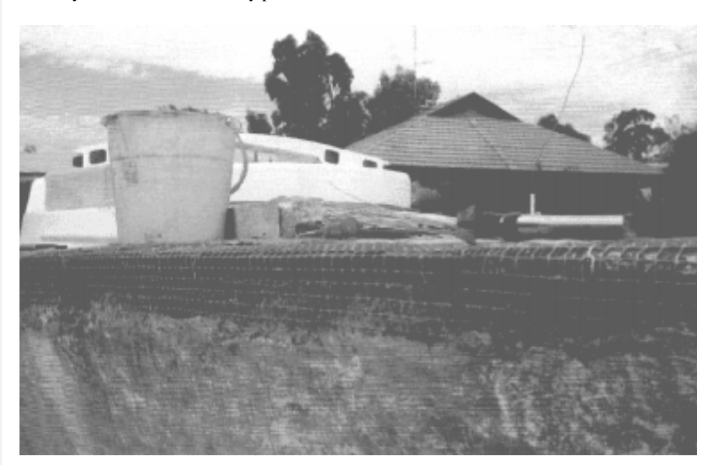
.. the same joint ready for re-plastering