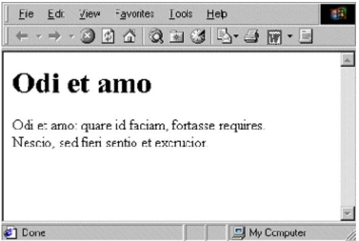
Figure 2-2: HTML markup and Latin content displayed in a Web browser.

Web browsers can't read Latin either -- or English, or any other language, for that matter -- so they rely on markup elements to tell them how to display content. Figure 2-1 shows how a Web browser interprets this bit of HTML and content and displays it.