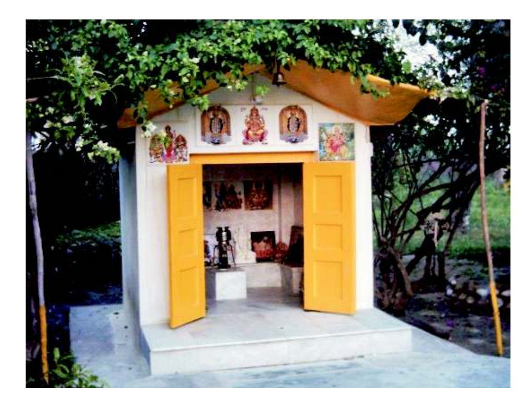
Little "Kali Temple" Jammu, India

"The whole world knows that Roma are from north India and they still have thousands of spoken words similar to our language Punjabi, Rajasthani, & Sanskrit etc. The scientific researchers have already approved it. We should do something in continuing this research on Language, literature, art & culture."