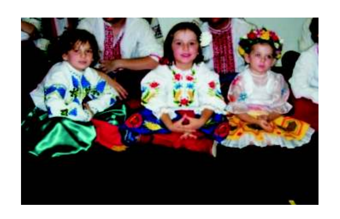
Romanies in Australia