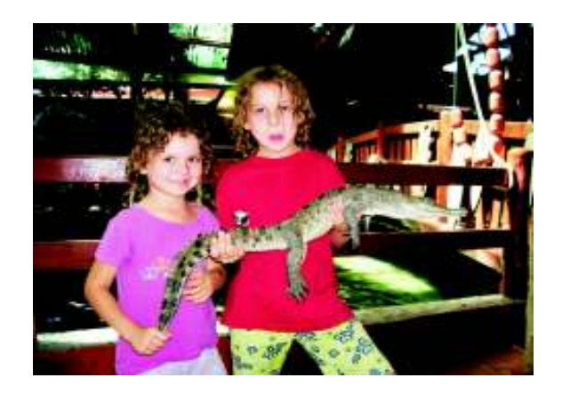
Romanies in Australia