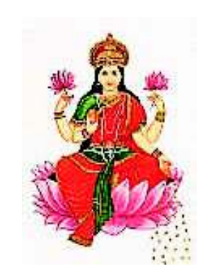
NATIONAL FLOWER OF INDIA: LOTUS