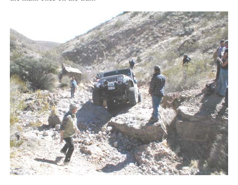
One being a V notch which the Scout made it through this year without any problem.

slips that was hung up constantly along the trail and crashing and banging the rest of the time. There were no bypasses to the obstacles and it was narrow in most places. 2 obstacles are the main ones on the trail.