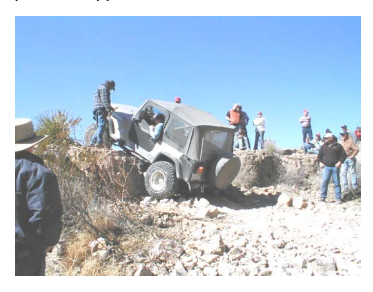
The second is a 4 foot ledge which took a bit of rock stacking to get most over including the Scout.