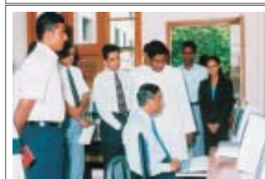
• Guests at the opening (above top) and trying out the new gear (above).