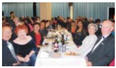
• Among the many of the guests who had a Night to Remember

Guests were ushered in to the old-time tempo of Night Shift or the swinging beat of the Radio Bandits (depending on the time of their arrival) and into the ambience of Benedictine bon homie and hospitality. The bands were once again sponsored by HSBC Bank in Castle Hill and