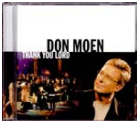
Thank You Lord Don Moen Retail price RM32.90

HURRY: Sign up NOW for a free one-year membership to the Praise Club.