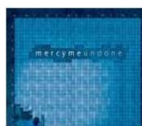
Undone MercyMe Retail price RM32.90