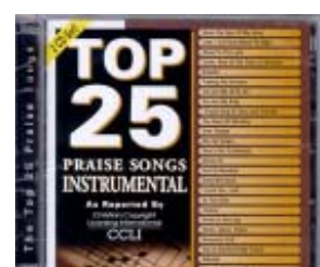
Top 25 Praise Songs Instrumental (2-CD) Retail price RM43.90

Other newly-arrived titles include WOF Irrepressible Hope (Women of Faith); Best of Sheila Walsh ; Make It Glorious (Tommy Walker); Top 25 Modern Worship Songs ; 24-7 (Point of Grace); Cry Holy (Sonic Food); Praise Jams (Club J); Almost There (Mercy Me); I Can Only Imagine Lullabies (Various artists); Our Sunday Best (Red and Green).