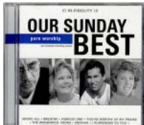
Our Sunday Best (Blue) Various Artists Retail price RM32.90