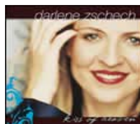
Kiss of Heaven Darlene Zschech Retail price RM32.90