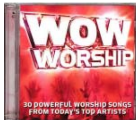
WOW Worship Red Various Artists (2-CD) Retail price RM43.90