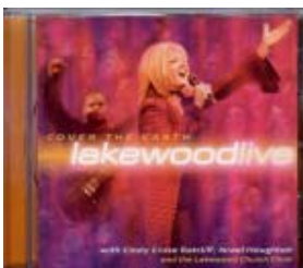
Cover The Earth Lakewood Live Retail price RM32.90