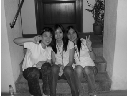
Some of the PJ and SJ members attending the theological course