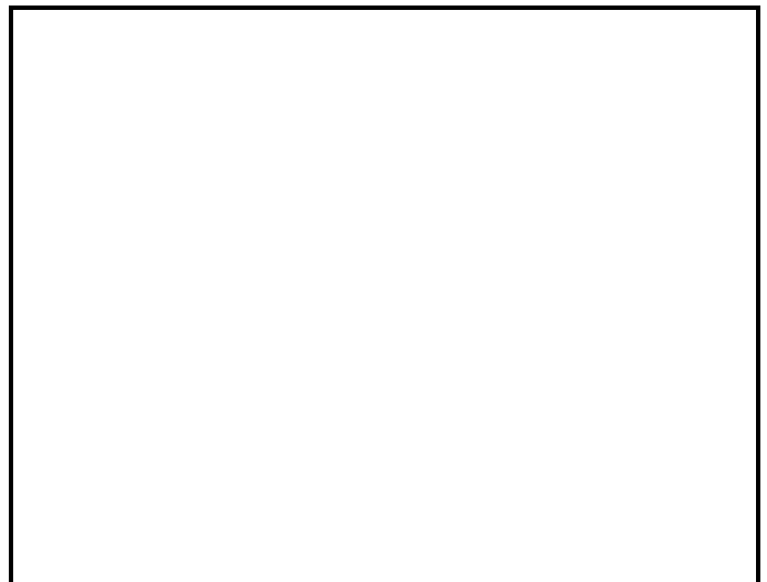
1998 Summer Picnic Fun

This year the Club invited local High School graduates that plan to attend Wisconsin in the fall semester - we would like to make a tradition of sending them off in style! We plan to have another picnic next summer, and may start the event off with an optional morning golf outing - block off June 19th, 1999 on your calendar today!