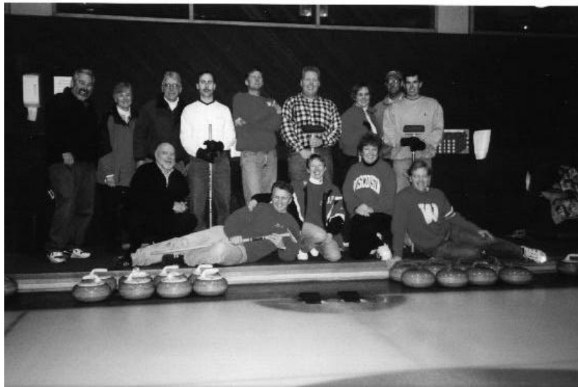
Spring 2000 Curling Event Group