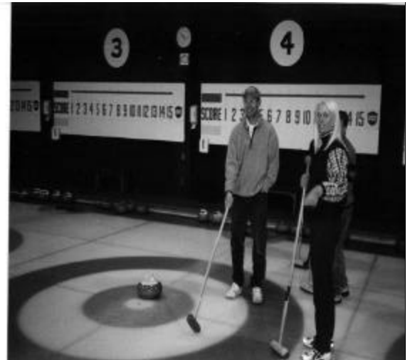
Spring 2000 Curling fun