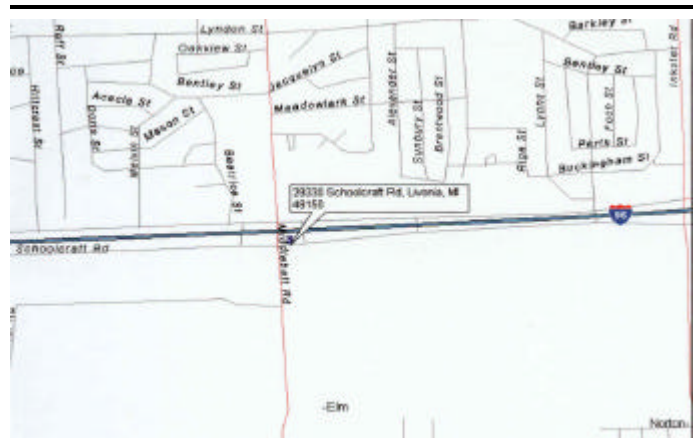
Map showing location of Chi Chi's Restaurant - site of UW-Penn State game Viewing