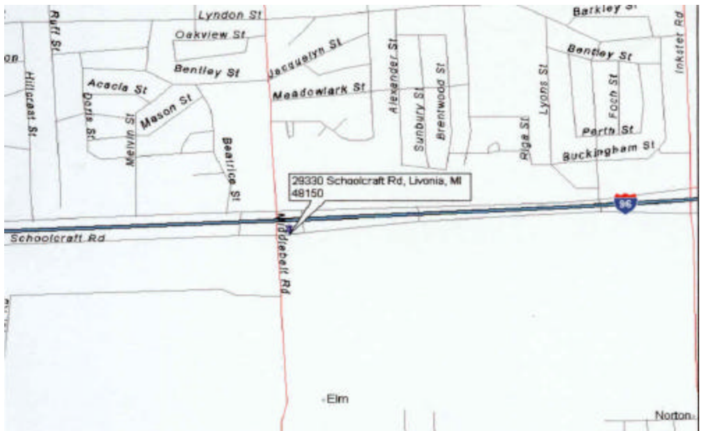
Map showing location of Chi Chi's Restuarant - site of UW-Penn State game Viewing