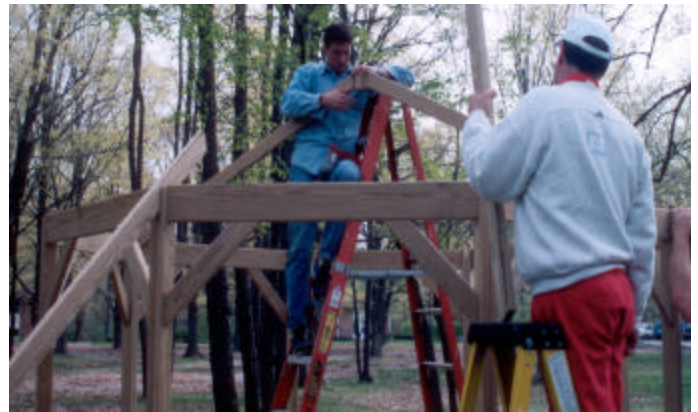
Master Roof Builders

The Boys and Girls Republic is a residence for teens of ages 13-18. On the grounds is the William E. Miller School, which is a public school setting designed for residents of the B&G Republic. There is a focus on changing attitudes, building self-esteem, and self-worth. Another goal is to introduce a practical learning environment and reference to the life skills of everyday life. The William E.