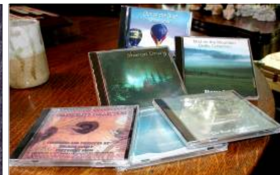
We have six CDs from keyboard artist and composer Sharon Drury, a Sault Summer Arts Festival participant from Barton City: Mist on the Mountain Celtic Collection , The Road Less Traveled , Night Songs , Out of the Blue and Dreaming .