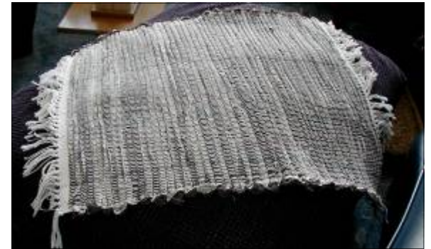
This hand woven black and white mat by Joyce Buchanan is of washable cotton