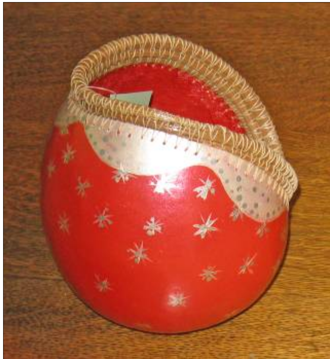
Celebrate in style! The 8" goblets are by Lorna Bricco.