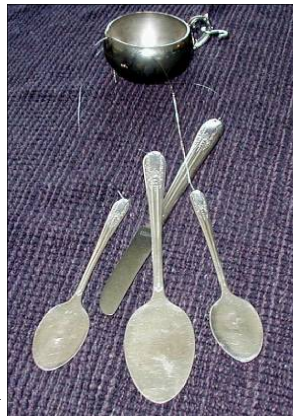
New life for old silverware. Sault craftsman William (Chip) Hagerty fashions these mellow toned wind chimes from old silver plate flatware. Stainless steel won't do—the sound is too bright. We have some hanging on our deck and never get tired of the aural kaleidoscope.