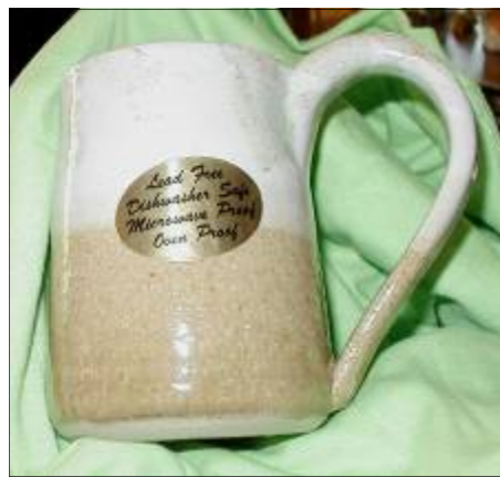
Hot chocolate for a really cold day could be served in this big (4 1/2" high) stoneware mug by William Hagerty of Wetmore (Blue Lake Pottery). He won the SSAF Pottery Award in 2008.