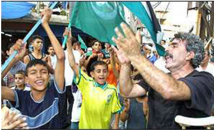
Arabs celebrate destruction of WTC