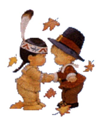
HYMN –#235: "Praise the Almighty, My Soul Adore Him"

WE ARE THE SHEEP OF HIS PASTURE—That we are called God's sheep tells us more about him than it does about us. It communicates his provision for us, his tender care, his patience, his loving discipline, his protection. We thank God that, in his care, we are, body and soul, completely at peace.