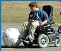
19" Sparteck Ball