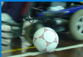
10" Sparteck Ball, Presented in Portugal