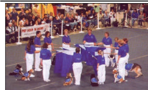
2001 Drill Team featured in a National Magazine.

The members of our Drill Team enjoy the fun and challenge of choreographing, perfecting, and finally performing a new drill every year for the enjoyment of spectators at the Lower Mainland Dog Fancier's show. We also perform by invitation at community events all over the Lower Mainland.