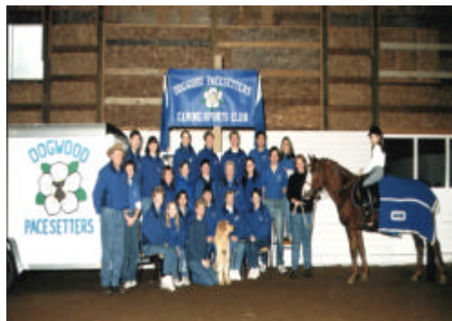
Club Members with PADS Dog and PRDA Horse sponsored by the Dogwood Pacesetters

The Pacific Assistance Dog Society (PADS), a non-profit organization that raises and trains dogs for people with disabilities to provide them with a greater level of independence and an enhanced quality of life. Visit them at: www.padsdogs.org