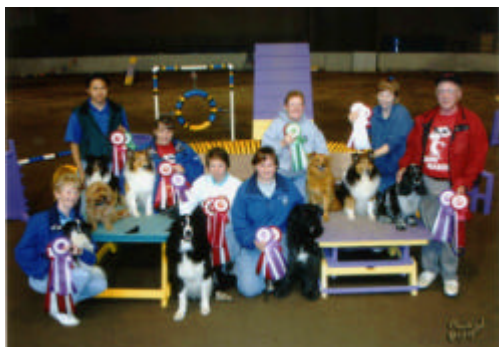
Pacesetter Winners at 2001 BC Agility Regional Championships

Promoting the Human-Animal Bond for Over 15 Years