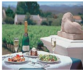
AI fresco dining

Room Service takes care of those lazy moments and a well stocked bar to keep your spirits flowing.