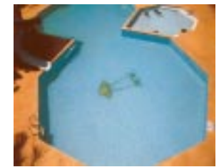
Aerial View of the Pool