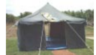
Rustic living in a real tent