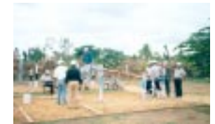
Dynamic Obstacle Course