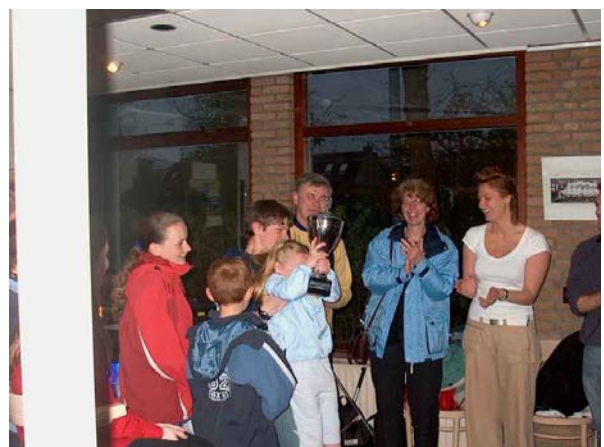
The winning team with big brother hoisting little sister (and trophy) into the air - not for the first time that day!