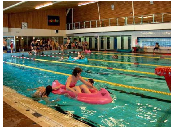
Only the youngsters kept the canoes upright

The gala is without a doubt a lot of hard work, what with all the preparations and organizing before and after, but it is worth it, just to see so many having a good time. It is only possible because of the amount of help, generously given by fellow club members.