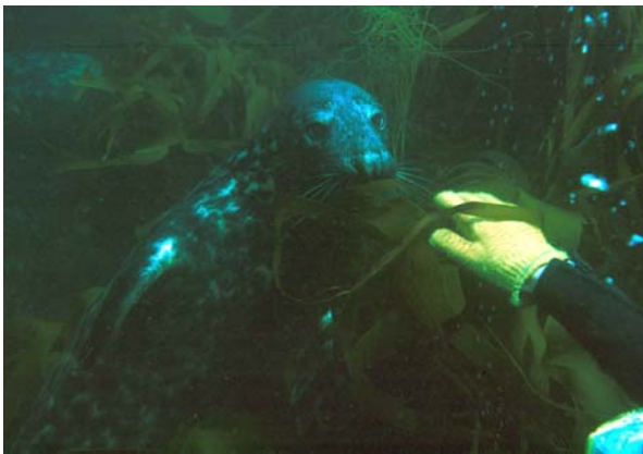
A typical Scilly's shot!