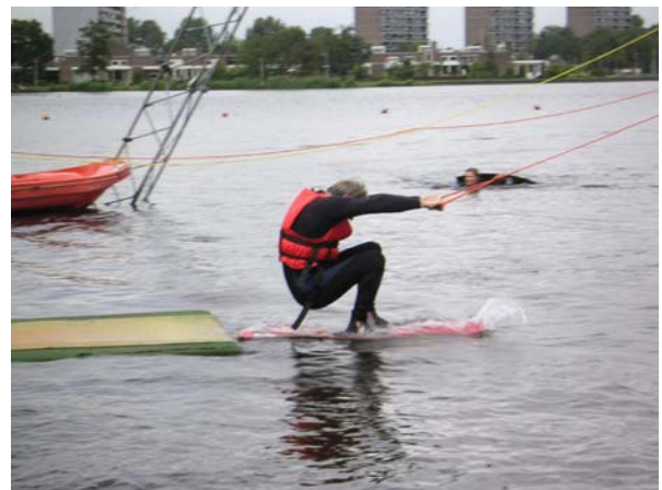
Con getting down to it!

We arrived at the Wet 'n' Wild complex full of good hopes for a great day full of fun and water. Our enthusiasm had diminished a little once we were ready; mostly nerves but also the smelly wet suits had dampened the spirits. However, this disappeared once we were in the water and it certainly did not stop people from having a great day.