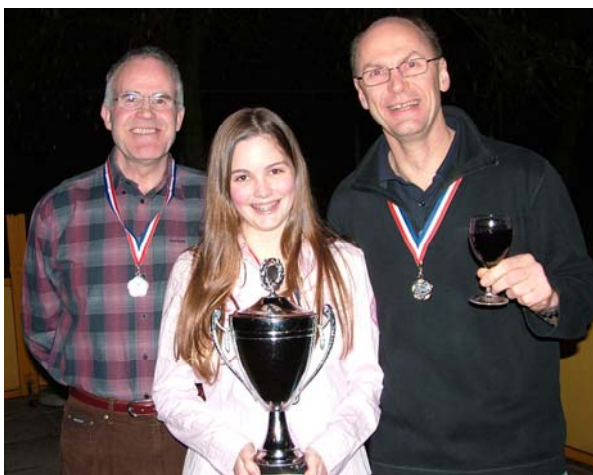
Looking like winners!