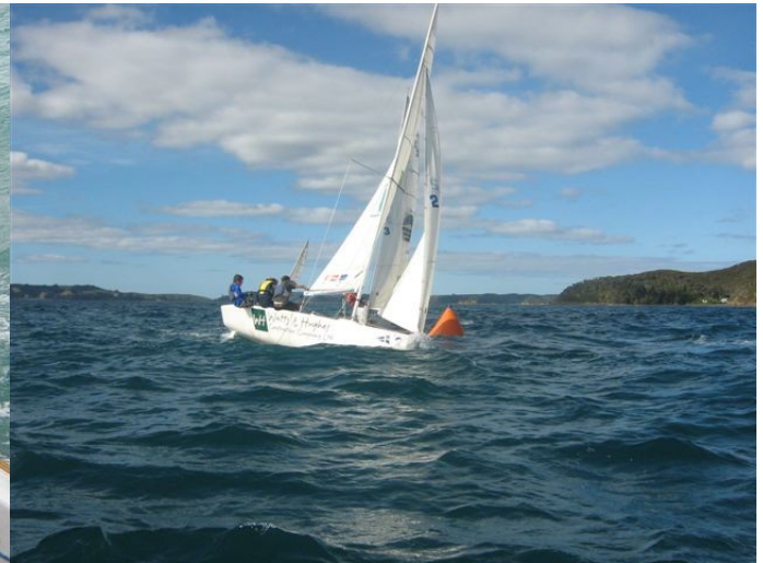
Rounding the boy sailing an Elliot 6

It was great weather for it and we had lots of wind every day, in fact we sailed round Kawau Island in about 30knots of wind.