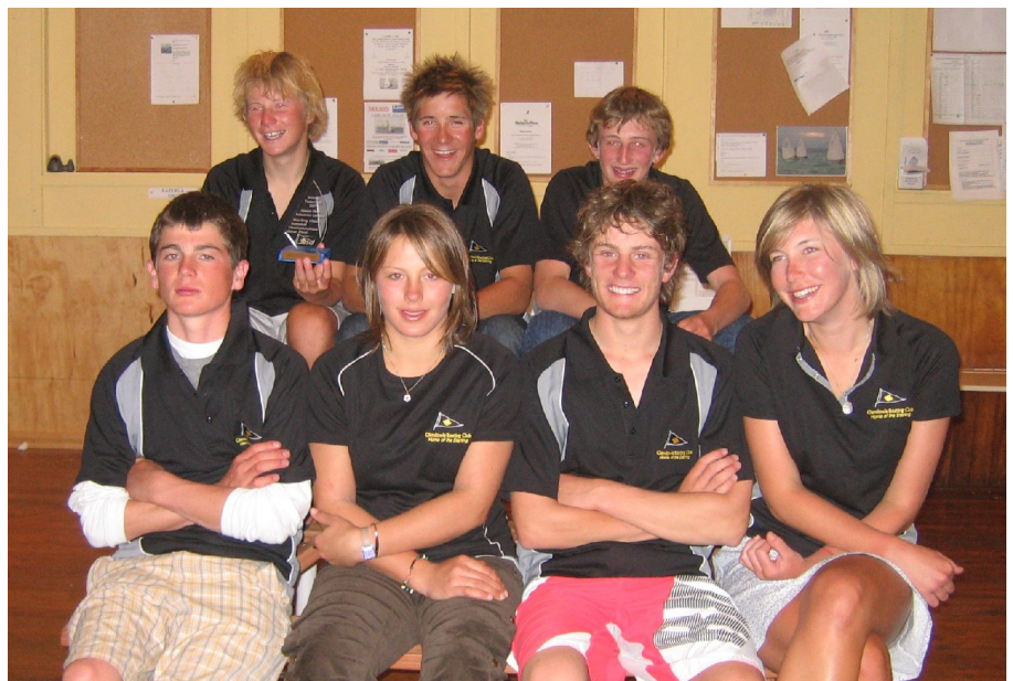
The 2007 Starling nationals Team who sailed in Nelson