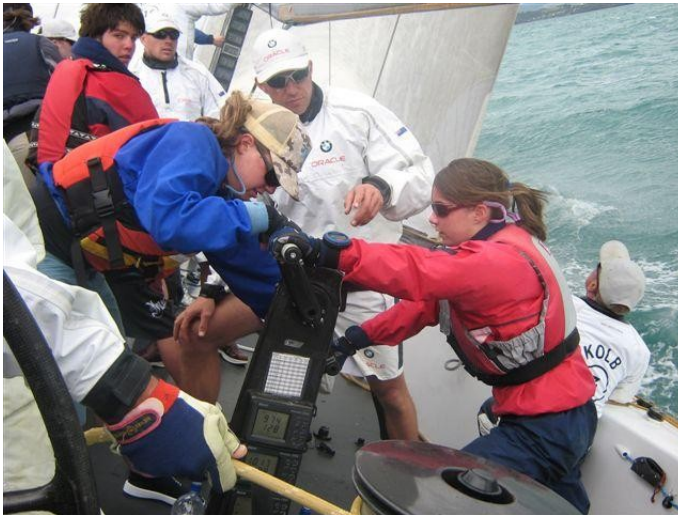
Grinding on Oracle

The girls slept inside the Lidguard house while the boys had to sleep in a big white tent, which wekas thought to be their toilet! Every day at 7:00am we would get up and by 8:00 had to be ready for breakfast at the yacht club. Some mornings we braved the water and went for a swim to wake us up. Sailing was from about 9:30 till 5 or 6:00 at night.