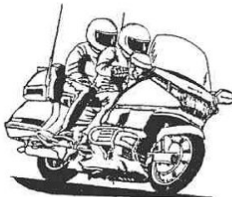
Co - rider