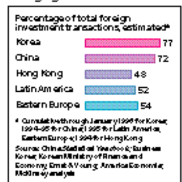
ENR12 Importance of alliances in emerging markets

Why are joint ventures in emerging markets proving so difficult? The answer lies in the fact that multinationals and companies in emerging markets must overcome formidable differences if they are to develop successful alliances.