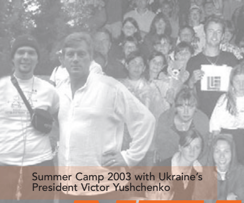
Summer Camp 2003 with Ukraine's President Victor Yushchenko