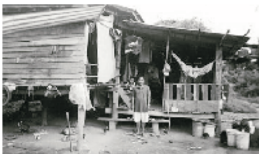
An example of poverty housing in Thailand.