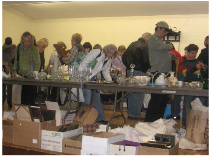
The Garage-to-Attic Sale at its busiest.