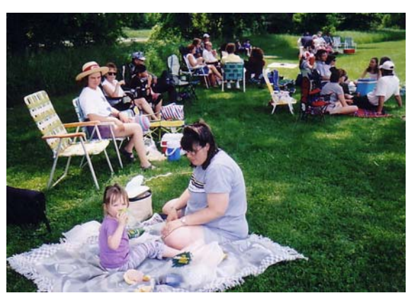
The Fallowfield Sunday School Year-End Party, June 22, 2002, at Steeple Hill Park