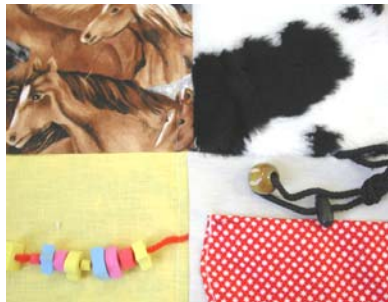
Detail from one of the fidget quilts

The Merivale Quilters meet each and every Wednesday, weather permitting. We are working on two large top quilts.