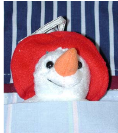
Detail from one of the fidget quilts.