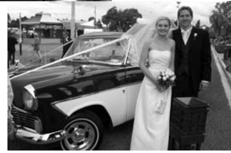
Wedding on the Bay in February