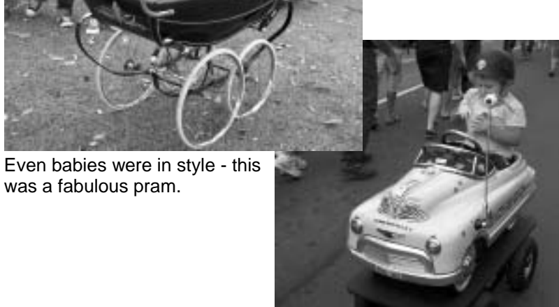
Halewa riding in style