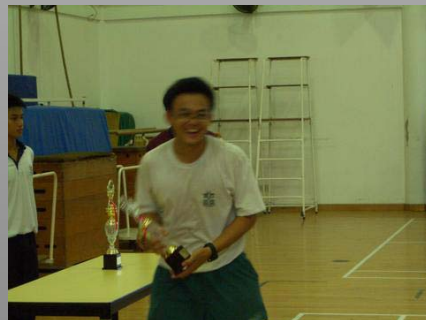
That's one happy winner!