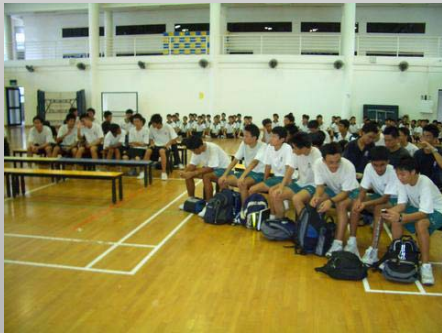
The participants waiting for the results, with our own cadets in the background

Although the event was not without hitches, on the whole it still ran rather smoothly and we are pleased to say it was a success in its own right.