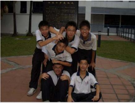
The NAPFA Challenge 2005 Committee

22nd April 2005. A date to remember, as our unit organised and ran its annual NAPFA Challenge. Maris Stella High NPCC unit had given the opportunity to six secondary 3 squad cadets to organize the annual NAPFA Challenge from in Maris Stella High School. NAPFA Challenge is an annual event organized exclusively by our unit to allow NPCC cadets from all over the nation to gather together and compete with one another over a standard fitness test. The event also gives the chance for cadets to communicate with other cadets from different units.