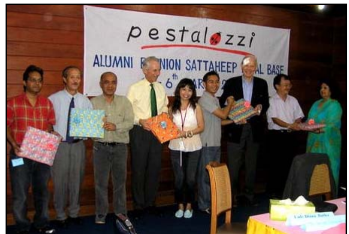
Reunion delegates receiving gifts from Thai Pestalozzi Alumni