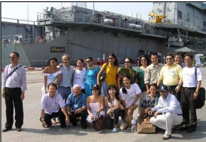
Reunion delegates at the historic Royal Ship in Sattaheep, not far from the Naval Base, where the Reunion was held