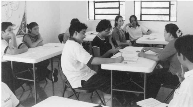
The 2002-2003 Freshman class

additional computer to the Computer Lab. We were also very thankful for the number of our students that participated in local Hurricane Relief efforts after Hurricane Isidore devastated our area.