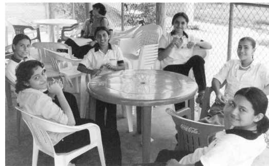
Girl talk at the snack break

As we head down the home stretch of our 2 nd school year we continue to expand the physical plant, upgrade our science and computer labs, and dream