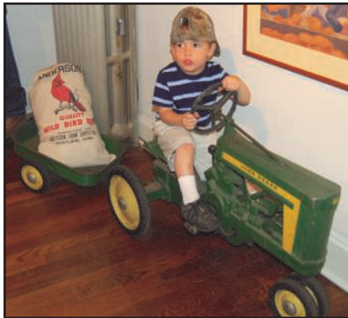
A young visitor to the Museum's Farm Exhibit enjoys testing the tractor.

My term as President of The Portland Historical Society is coming to a close and I would like to take this opportunity to thank you all for your support of the Society's mission and projects. It has been such a pleasure to meet and work with such a wonderful