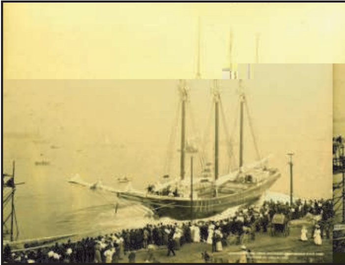
Launching of Schooner Frank Brainerd in Rockland, Maine, September 24, 1908.