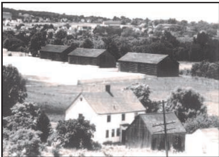
Aerial View of the Nick Nelson Farm, 1949 Front buildings, L to R: House, Barn, Icehouse/Milk room Rear buildings: Goodrich Farm Tobacco Barns