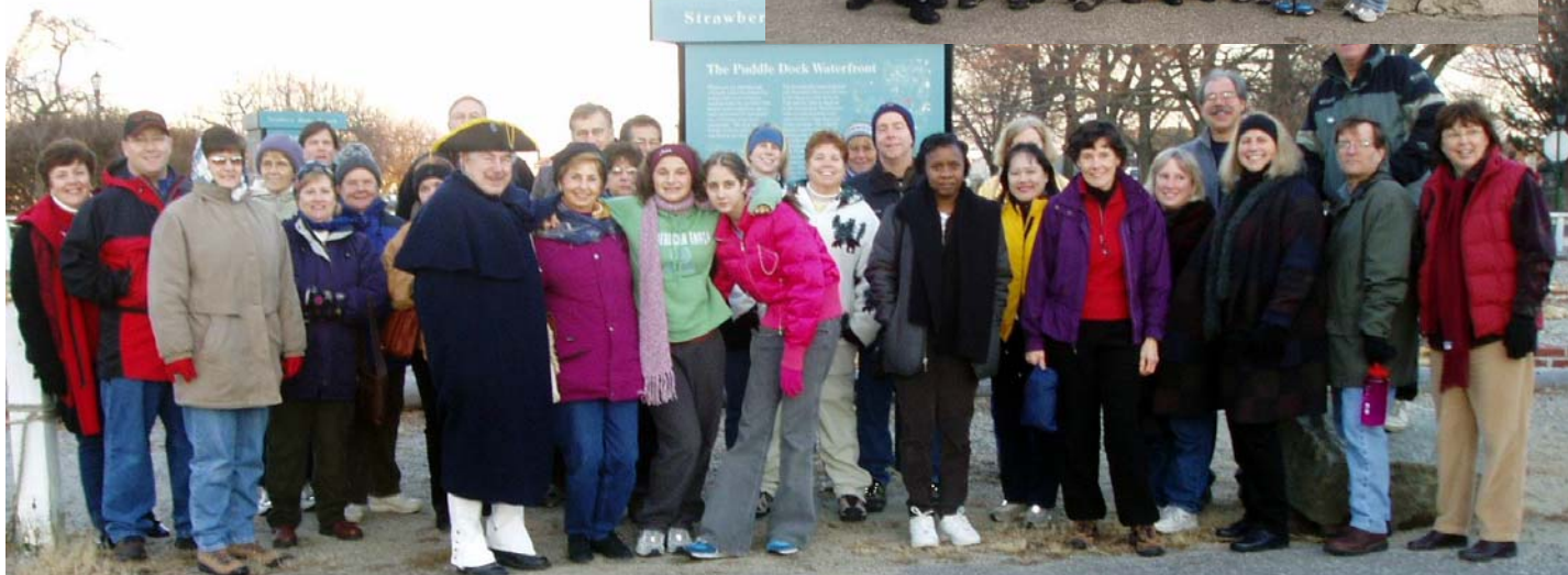
PVHC at Strawberry Banke – Candle Light Stroll