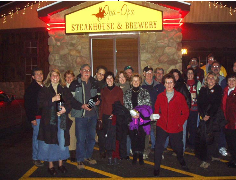
First Night – Dinner at Opa Opa before ringing in the New Year.