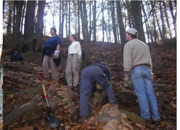
November M-M Trail Maintenance Day