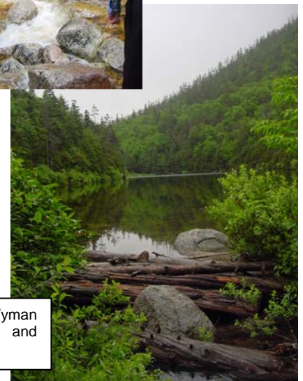
A sampling of pictures from Heather Wyman from the White Mountain Sampler and Greeley Pond Hike on June 17-19, 2005