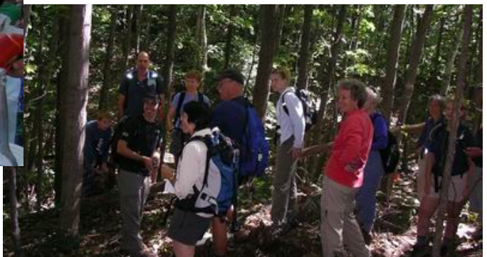
Long Mt. Map & Compass Seminar– Sept 10, 2005