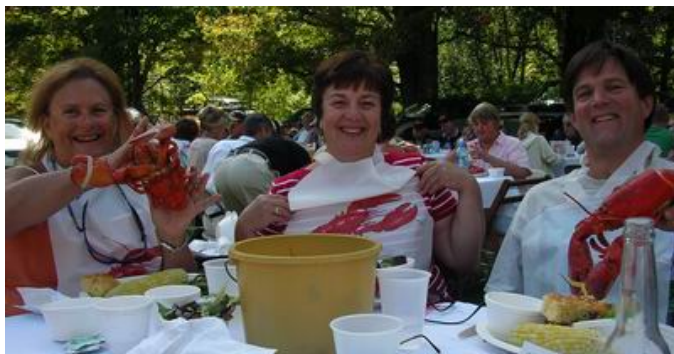
Remington Lodge Clam Bake – September 11, 2005