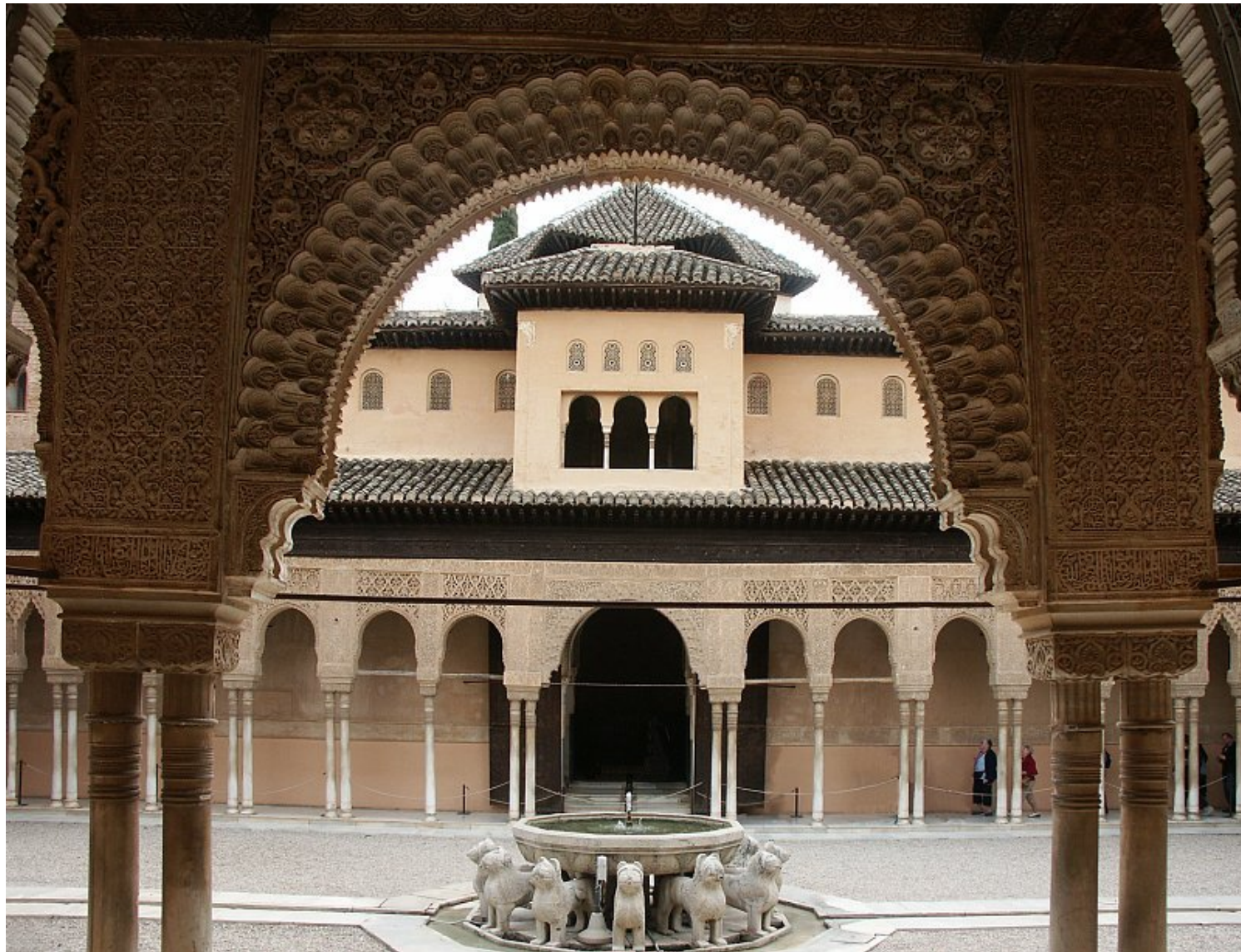
The Alhambra in Granada, the magnificent castle of the Arab heritage in southern Spain