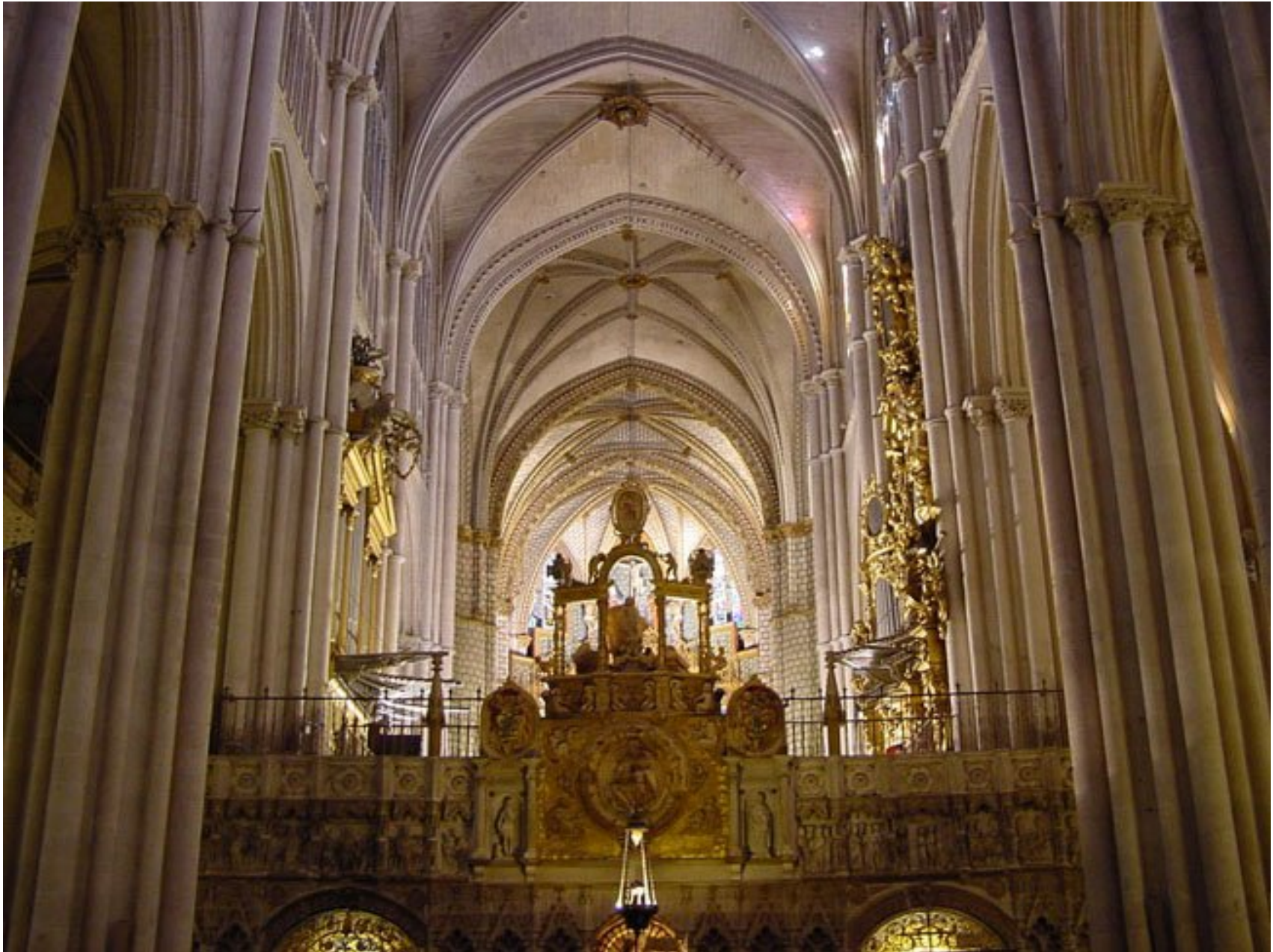
Or the Toledo Cathedral