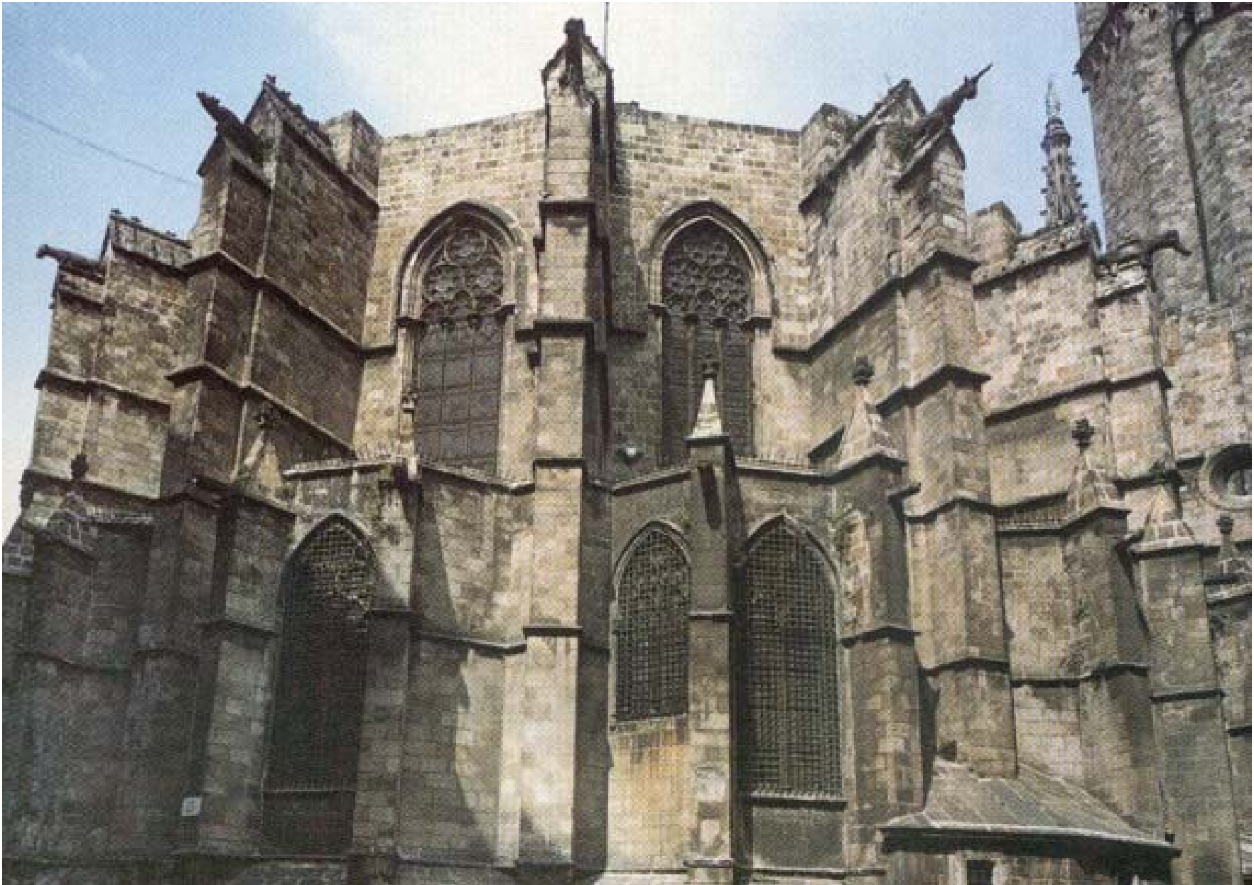
Cities with famous cathedrals such as Barcelona