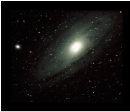
The Andromeda Galaxy (M31)