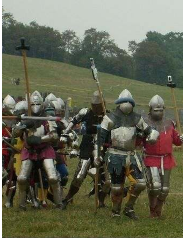
Aengus captures an opponent and removes him from the field to discuss ransom